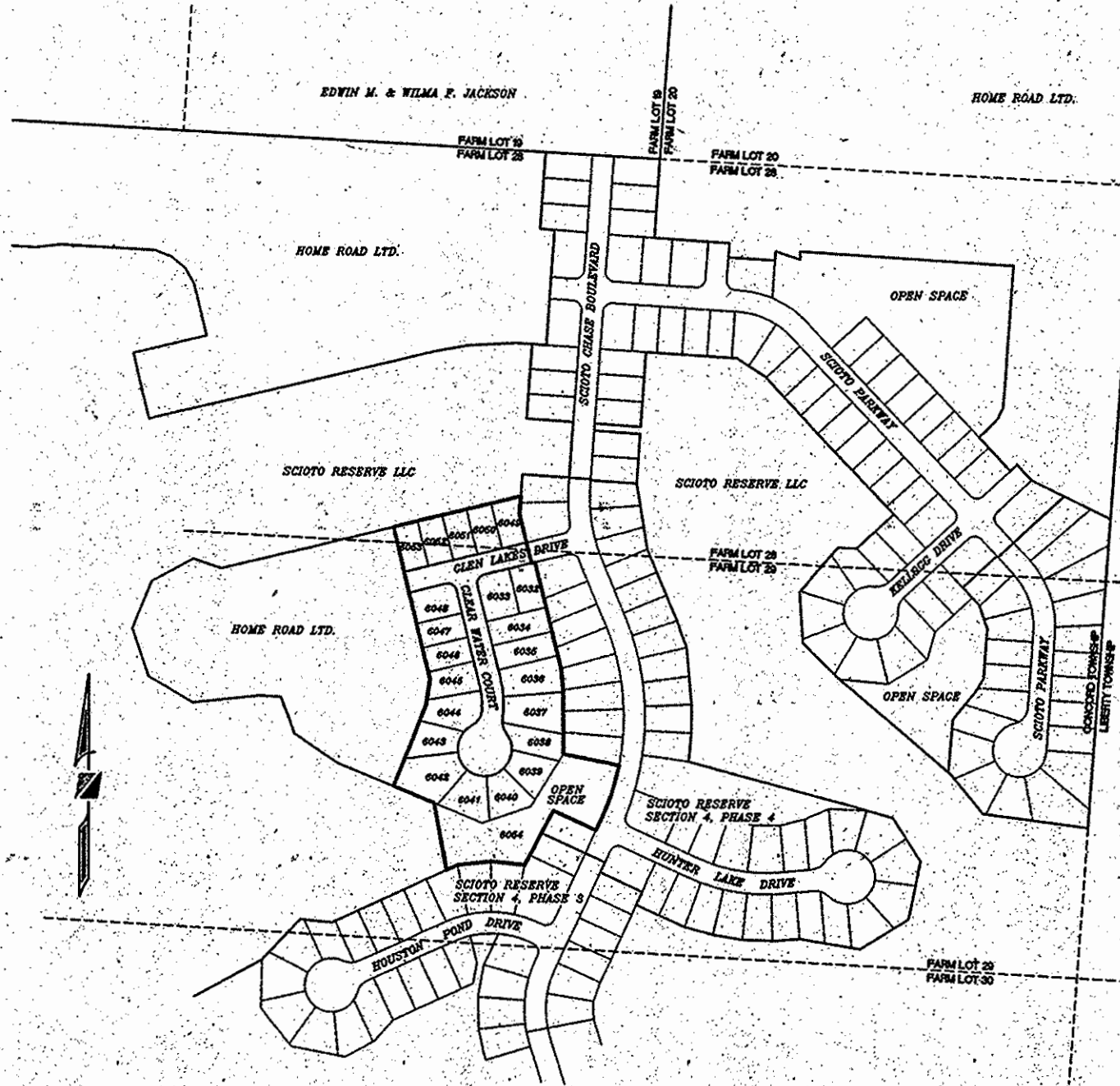
BACKGROUND MAP SCALE: 1" = 200'

[Signature] REGISTERED SURVEYOR NO. 6094 DATE: 7/19/02